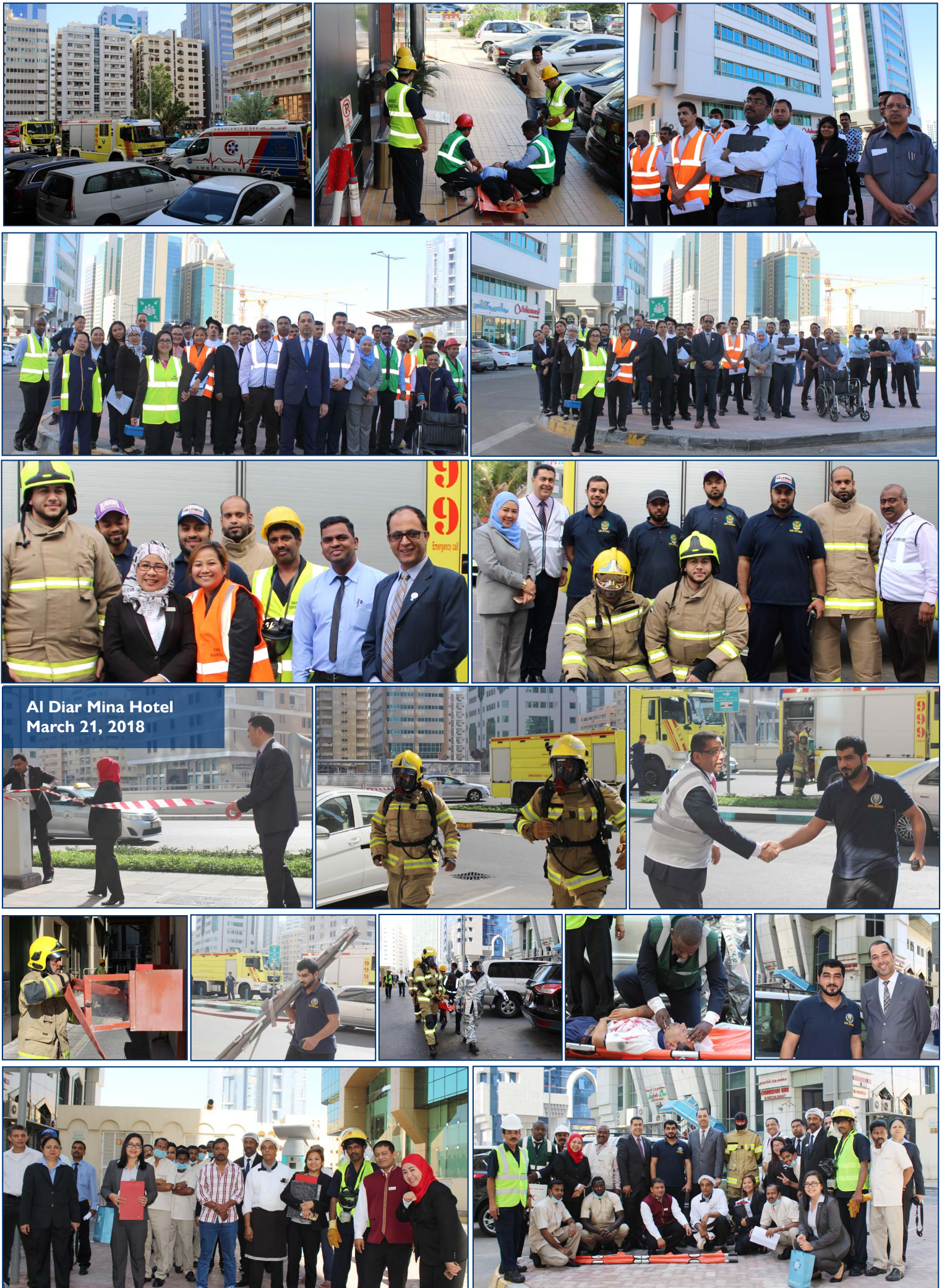
Al Diar Mina Hotel March 21, 2018