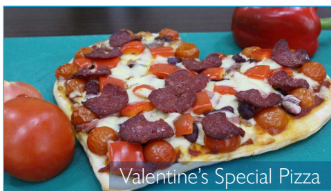
Valentine's Special Pizza

For reservations and enquiries, please call 02 645 6000 .