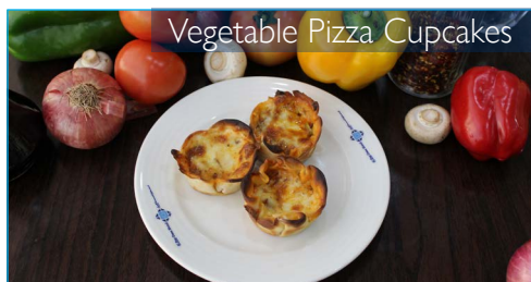
Vegetable Pizza Cupcakes

Marigold Restaurant in Al Diar Dana Hotel offers oven fresh pizzas in various concepts and shapes. Early this year of 2019, Pizzeria Italiana offers