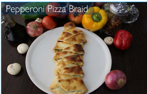
Pepperoni Pizza Braid