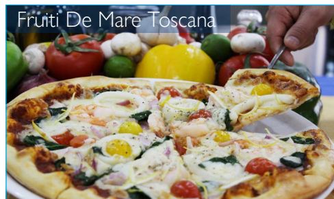
Fruiti De Mare Toscana