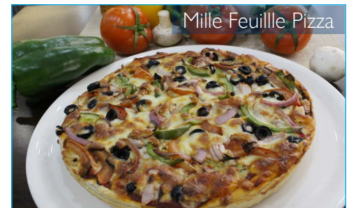
Mille Feuille Pizza