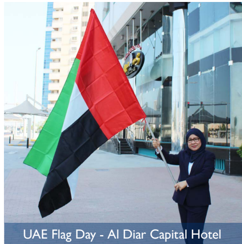
UAE Flag Day - Al Diar Capital Hotel

Al Diar Insider took a glimpse of the mentioned celebrations at Al Diar Capital Hotel, Al Diar Dana Hotel and Al Diar Sawa Hotel Apartments.