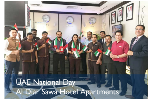
UAE National Day Al Diar Sawa Hotel Apartments

the Customer Review Awards plaque from Agoda on November 2019.