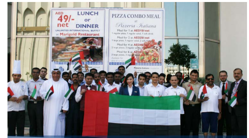
UAE Flag Day - Al Diar Dana Hotel