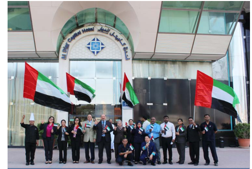
UAE Flag Day - Al Diar Capital Hotel